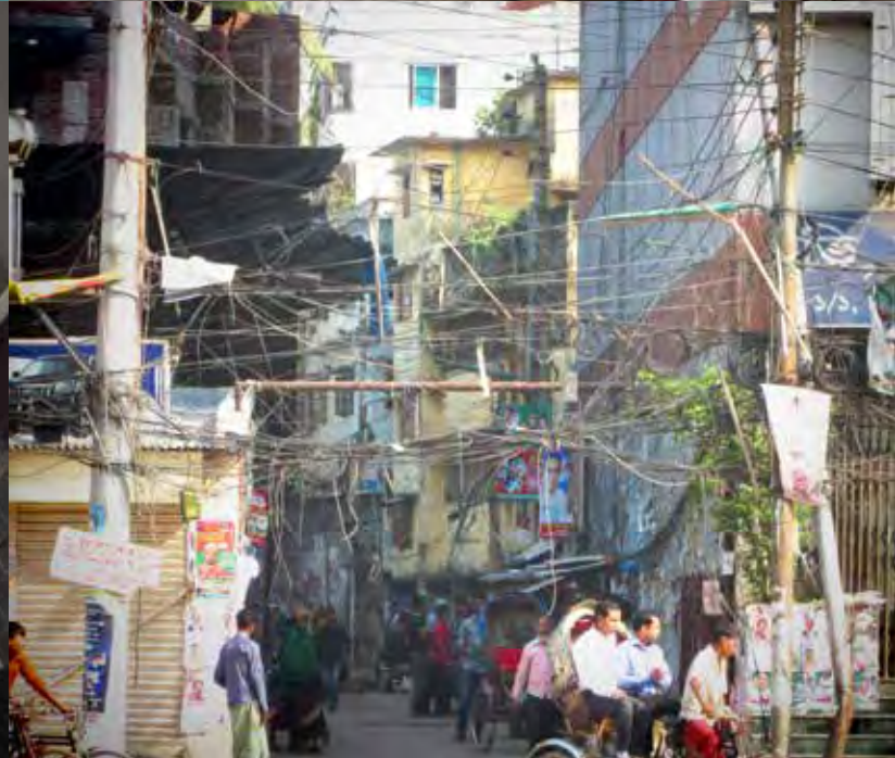
Street-side views of electrical wiring in Dhaka and fire safety tools inside a garment factory.