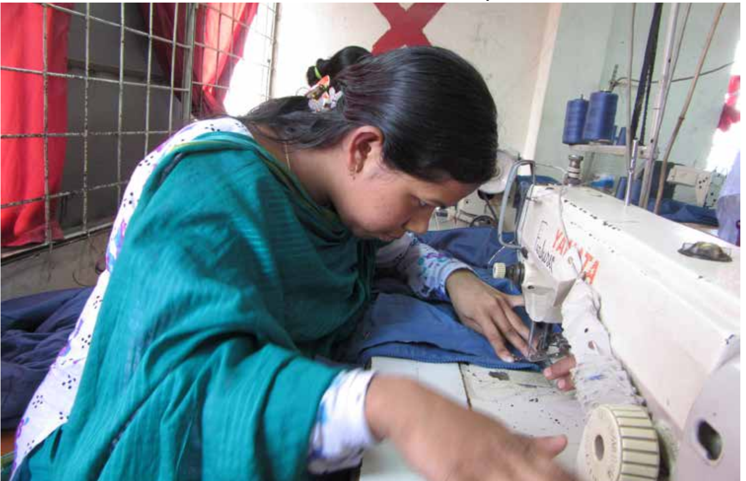
Factory-level union leader at Luman Fashion.

safety and labor regulations. People everywhere can play a critical role in advancing these social safety reforms by holding apparel brands and retailers to account, urging meaningful action from governments, demanding that workers' voices be heard, always asking: Do we know what it means to be safe for workers?