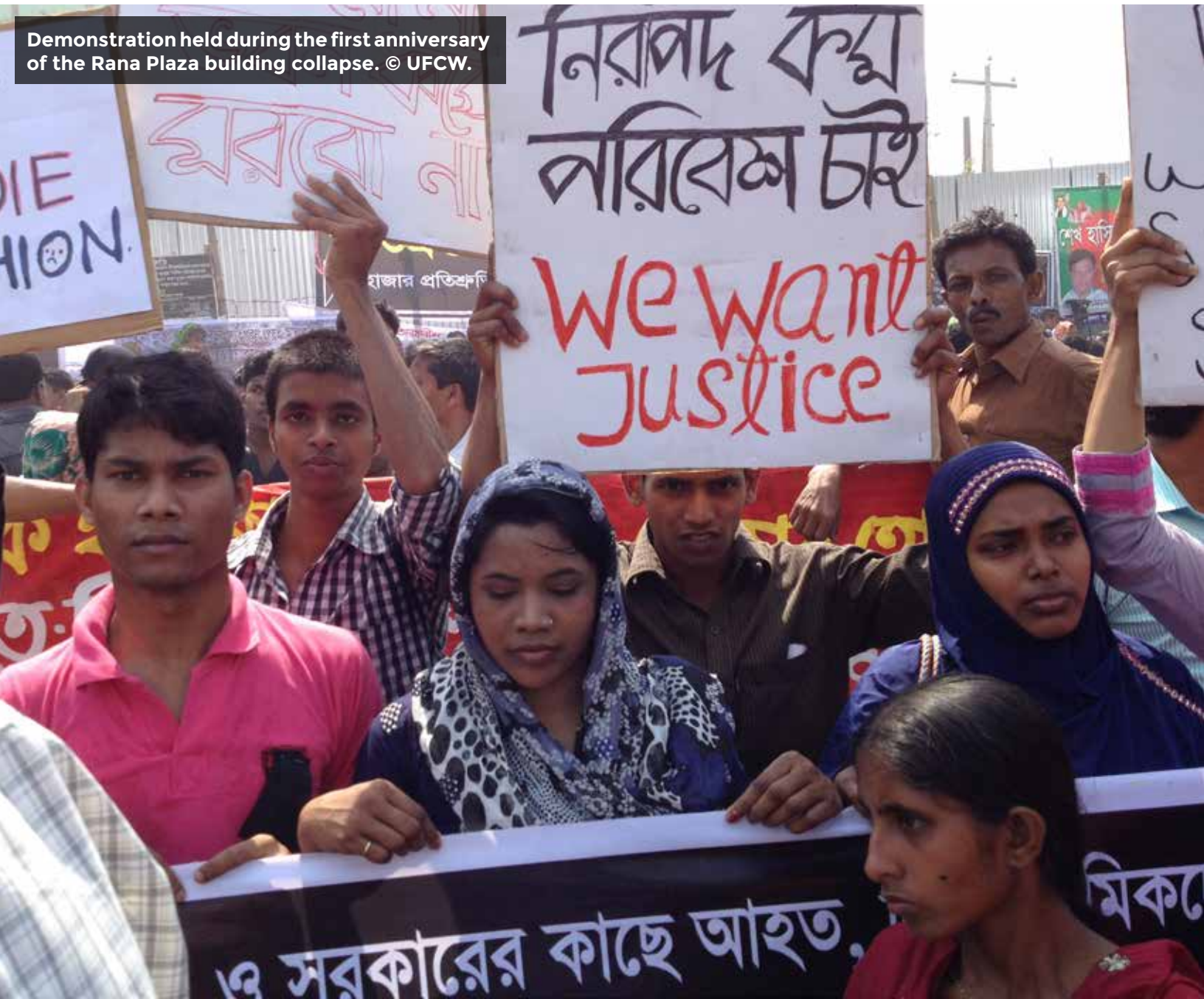
Demonstration held during the first anniversary of the Rana Plaza building collapse.