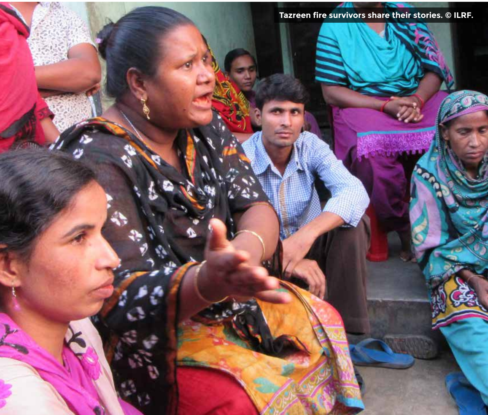
Tazreen fire survivors share their stories.